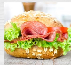
Premium Meat Product